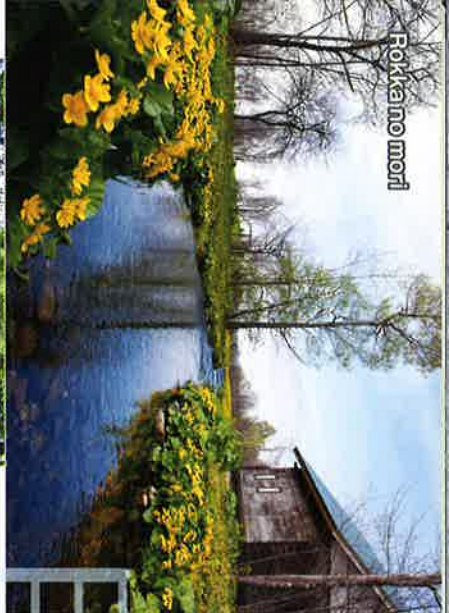
Resort and Villa Ferendorf