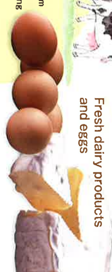
Fresh dairy products and eggs

N akasatsunai's farm products are grown in fertile rich soil using beautiful water.