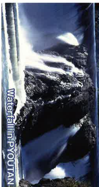
Waterfall in PYOUTAN

中 劔内村位于北海道十勝平原的西南部，是日高山麓廣闊的農業地帶，宏偉的景觀，多彩的景象。在這美麗的大自然中，使來客身心放鬆，愉快而歸。