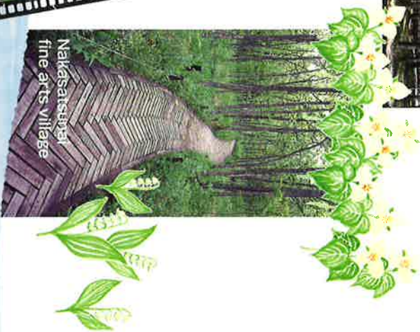
Nakasatsunai fine arts village

Nakasatsunai village is a farming area located in south west Tokachi Plain at the foot of the Hidaka Mountain Range. The majestic nature, expressive landscape and colorful flowers have a healing effect on visitors.