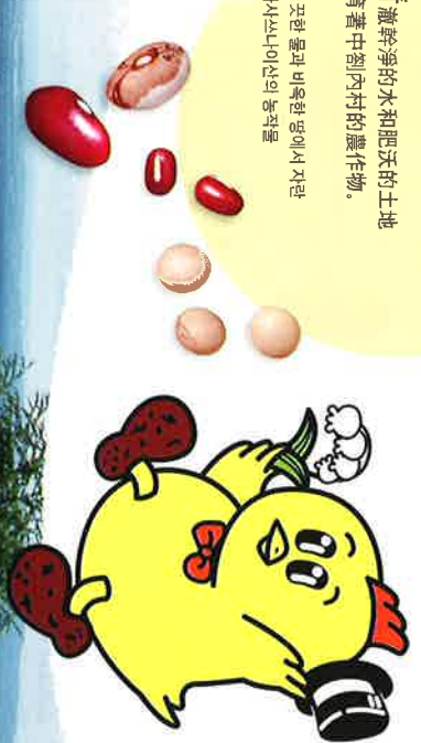
Nakasatsunai's village mascot